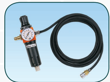
Pneumatic Tool Accessories