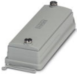
HEAVYCON ADVANCE, IP66, B24 protective cover for panel mounting side, with screw locking, with retaining cord, diameter of retaining cord eyelet: 3 mm

Please be informed that the data shown in this PDF Document is generated from our Online Catalog. Please find the complete data in the user's documentation. Our General Terms of Use for Downloads are valid ( http://phoenixcontact.com/download )